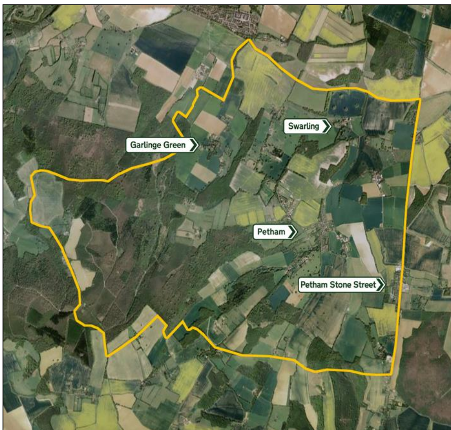
Aerial map of Petham Parish